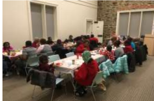
Residents enjoyed a meal together. ATA Youth Patrol received gift bags.