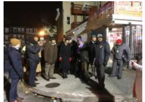
November 28 th 2018: The Mayor's VRI Site Visit (Violence Reduction Initiative)